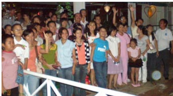
An outing of SCC scholarship students.

Since Hillsboro first became involved with SCC in the 2003-04 school year we have sponsored over 600 children, built two schools and helped with the Thao Long Vocational School projects. The Director and employees of Saigon Children's